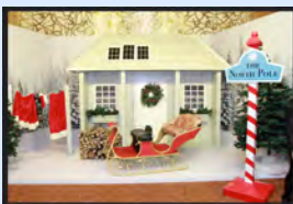
Photo Albums - 20th AmCham Governors' Ball & 3rd AmCham Breakfast with Santa

Highlights of the AmCham Scholarship 2001 - 2015 on YouTube video.