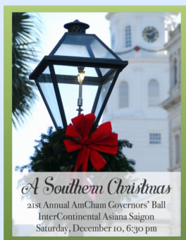
Photo Album, List of Winners of Raffle Prizes and Silent Auction - 21st Annual AmCham Governors' Ball

The 21st Annual AmCham Governors' Ball was organized successfully last Sat, Dec 10 at the InterContinental Asiana Saigon Hotel. We welcomed almost 420 participants. We have had many favorable comments about the dinner, the decorations, and the entertainment, and many guests stayed until the very end! Thank you very much again to our Ball Sponsors who contributed cash, products, and services to help add to the success of the evening. Through your support, the Governors' Ball raised over US $45,000 in net proceeds, all of which will go to support AmCham Scholarship Program.