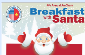
Photo Album - 4th Annual AmCham Breakfast with Santa

The 21st Annual AmCham Governors' Ball was organized successfully last Sat, Dec 10 at the InterContinental Asiana Saigon Hotel. We welcomed almost 420 participants. We have had many favorable comments about the dinner, the decorations, and the entertainment, and many guests stayed until the very end! Thank you very much again to our Ball Sponsors who contributed cash, products, and services to help add to the success of the evening. Through your support, the Governors' Ball raised over US $45,000 in net proceeds, all of which will go to support AmCham Scholarship Program.