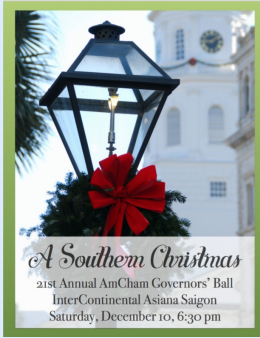
Photo Album, List of Winners of Raffle Prizes and Silent Auction - 21st Annual AmCham Governors' Ball

The 21st Annual AmCham Governors' Ball was organized successfully last Sat, Dec 10 at the InterContinental Asiana Saigon Hotel. We welcomed almost 420 participants. We have had many favorable comments about the dinner, the decorations, and the entertainment, and many guests stayed until the very end! Thank you very much again to our Ball Sponsors who contributed cash, products, and services to help add to the success of the evening. Through your support, the Governors' Ball raised over US $45,000 in net proceeds, all of which will go to support AmCham Scholarship Program.