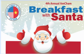
Photo Album - 4th Annual AmCham Breakfast with Santa

The 21st Annual AmCham Governors' Ball was organized successfully last Sat, Dec 10 at the InterContinental Asiana Saigon Hotel. We welcomed almost 420 participants. We have had many favorable comments about the dinner, the decorations, and the entertainment, and many guests stayed until the very end! Thank you very much again to our Ball Sponsors who contributed cash, products, and services to help add to the success of the evening. Through your support, the Governors' Ball raised over US $45,000 in net proceeds, all of which will go to support AmCham Scholarship Program.