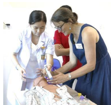
Advanced Pediatric Life Support Training (APLS) March 2019 – training doctor trainers to train other healthcare professionals in Vietnam