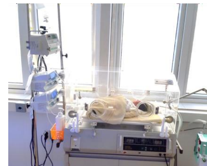
A premature baby was saved within a day of dead thanks to the equipment donated to Son La's General Hospital