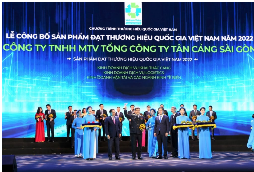
SNP received the Vietnam Value award for seven consecutive times

The reputation of SNP continues to be affirmed through the trust and partnership of customers both domestically and internationally. Notably, the Corporation has been honored twice with the title of the Labor Hero by the State and has received the Vietnam Value award for seven consecutive times. Tan Cang Cat Lai Terminal and Tan Cang Cai Mep International Terminal (TCIT) receive Green Port award of APEC Port Services Network (APSN) in 2017 and 2020.